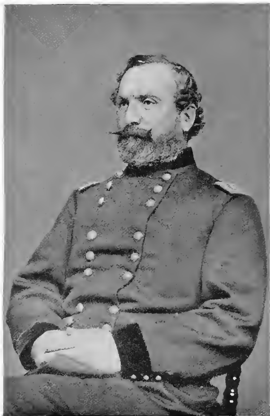
GENERAL JOHN SEDGWICK